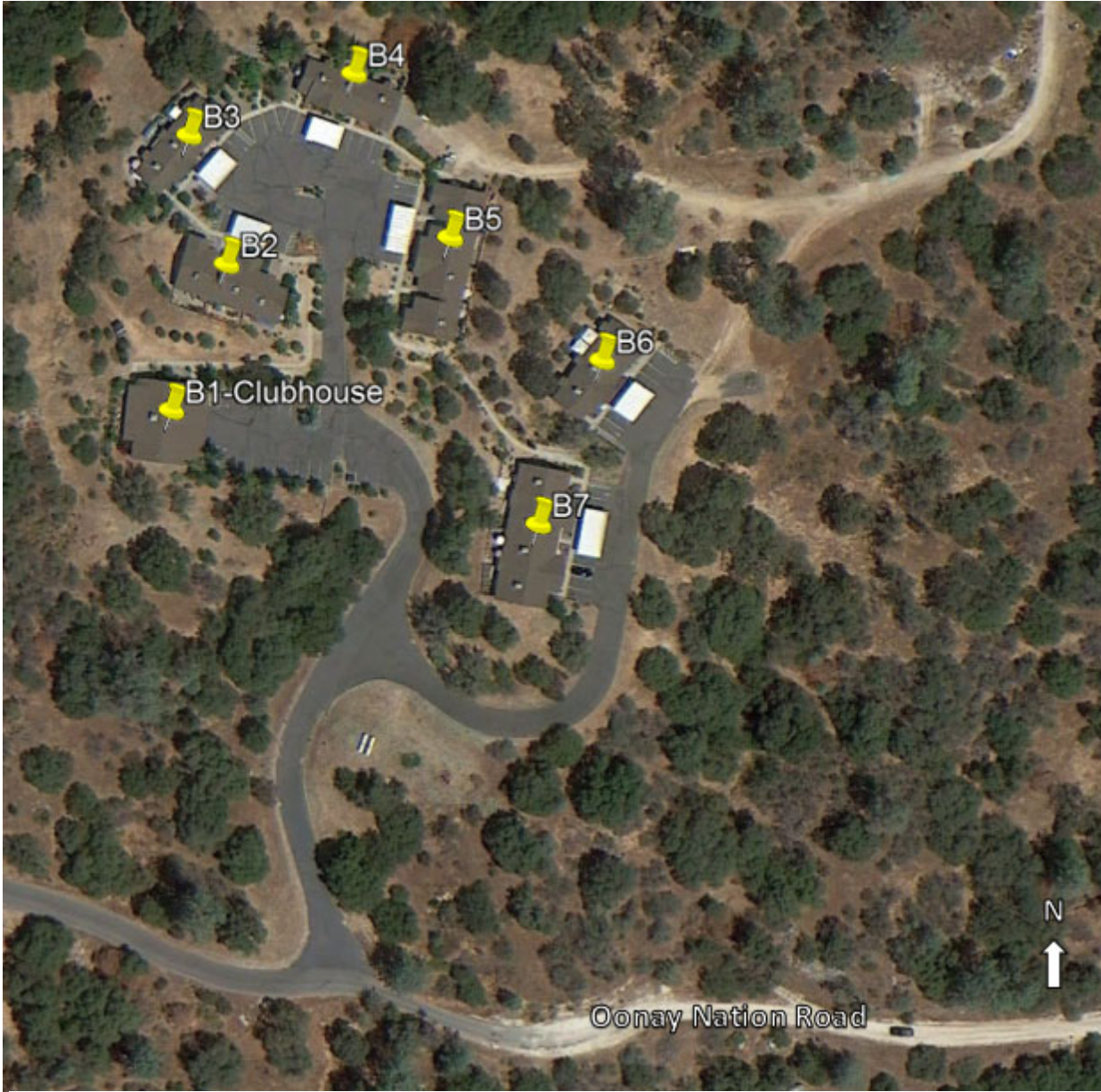
Figure 1: Overall Site Plan